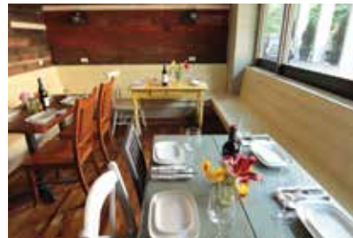
1st floor ( Snug Room)