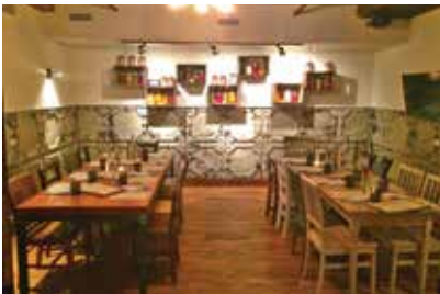
1st floor (Pickled Room)

FARMHOUSE EVANSTON 703 CHURCH STREET. EVANSTON, IL 60201 Features: 15-180 Seated, 15-200 Reception