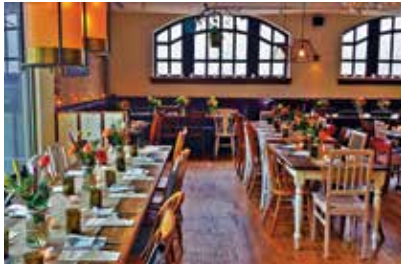
2nd floor (Beacon Room)