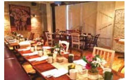
2nd floor (Hayloft)