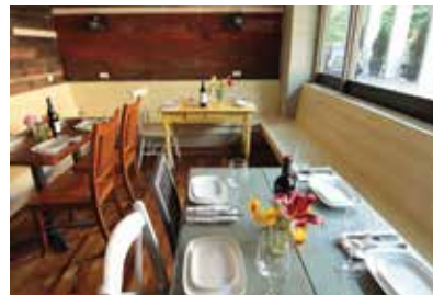
1st floor ( Snug Room)