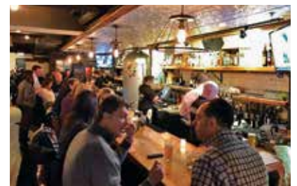
First floor Bar

FARM-BAR LAKEVIEW 1300 W WELLINGTON AVE. CHICAGO, IL 60657 Features: 15-45 Seated, 15-65 Reception