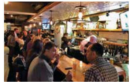
First floor Bar

FARM-BAR LAKEVIEW 1300 W WELLINGTON AVE. CHICAGO, IL 60657 Features: 15-45 Seated, 15-65 Reception